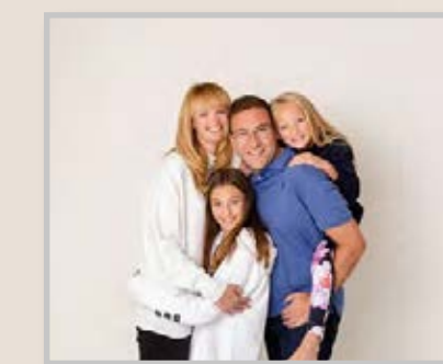
Large - (12" x 10")