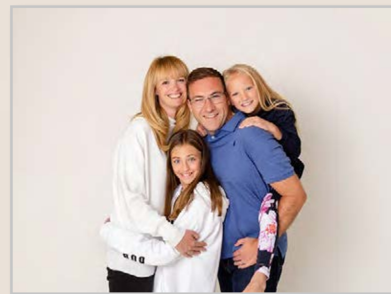
Medium - (24" wide)