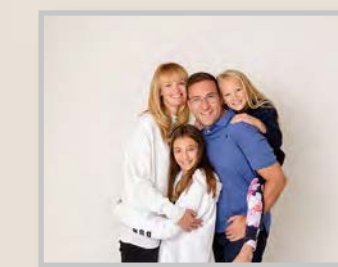
Medium - (10" x 8")