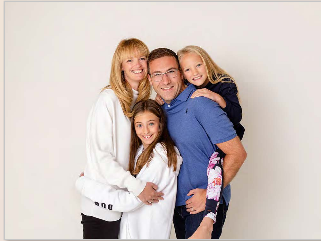
Extra large - (40" wide)