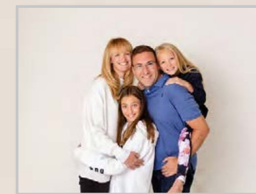
Mini - (16" wide)