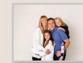
Small - (8" x 6")