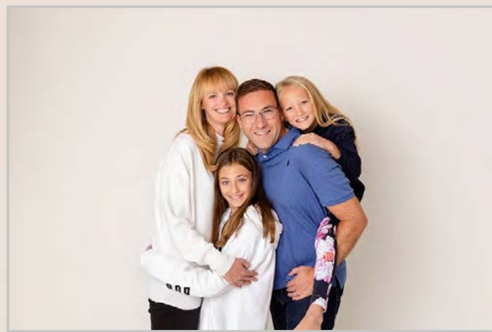
Large - (30" wide)

Here is a guide to help you imagine how the different product sizes will look on your wall. The size is based on the longest edge and is based on the dimensions of the photograph and mount.