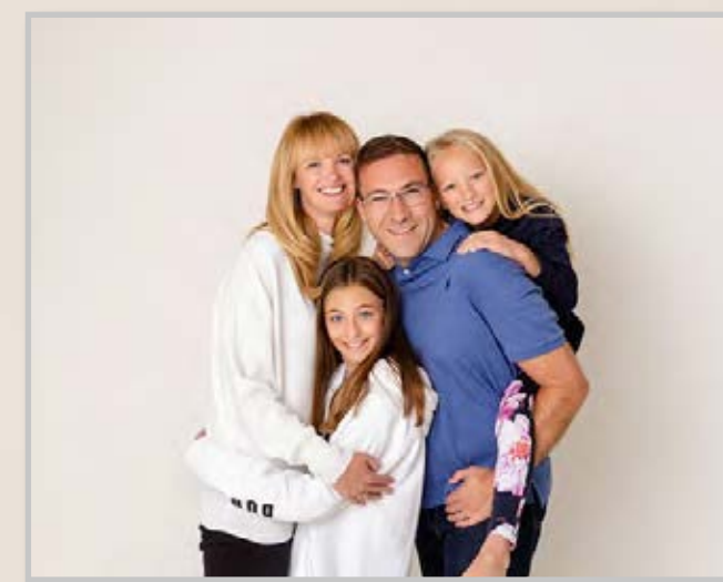
Small - (20" wide)